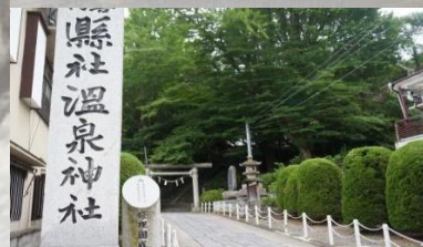
Nearby spiritual hot spot