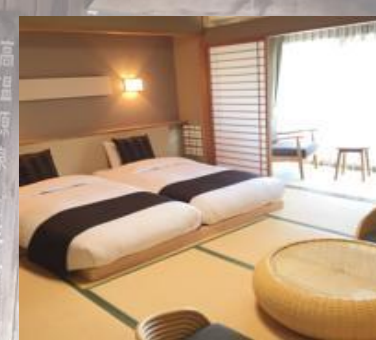
Bed room & tatami