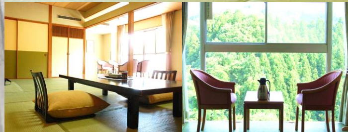
Japanese-style traditional room